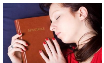
Reading your Bible in bed might not be the best idea!